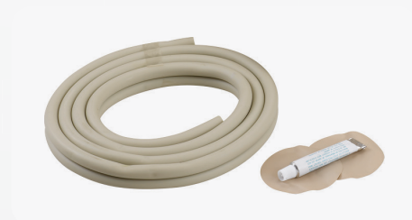
Hose & repair kit